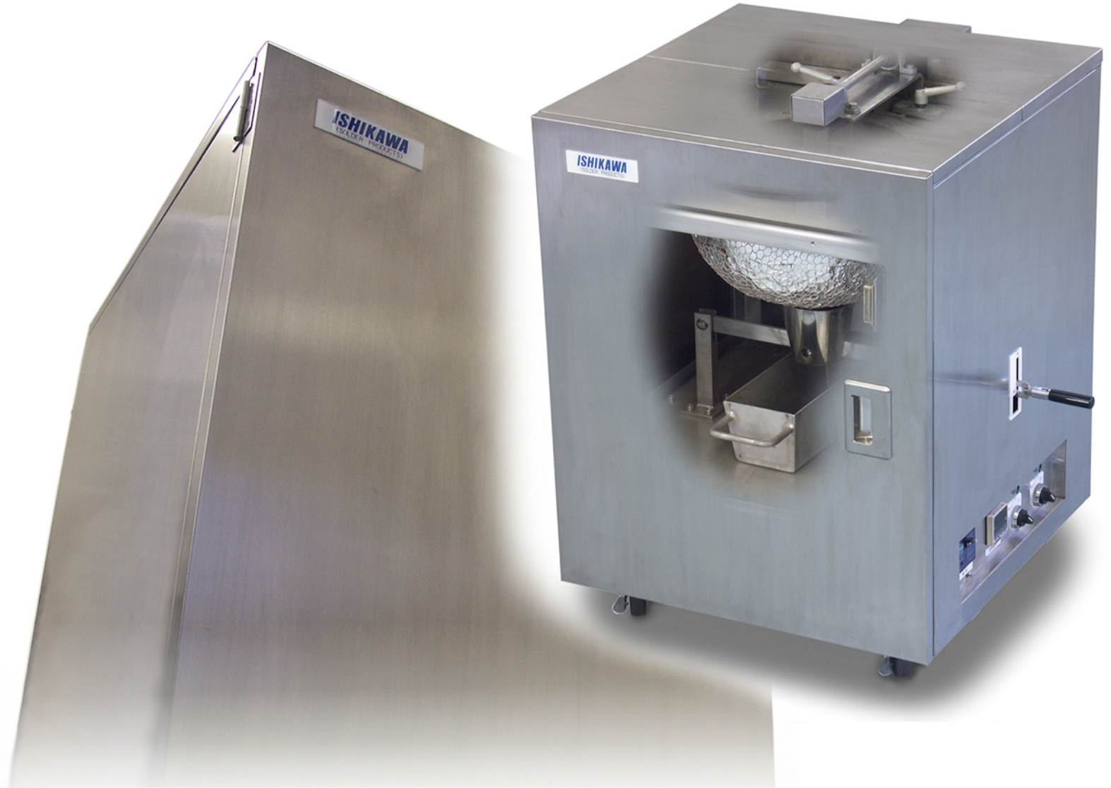
Solder Dross Separator Fine 105-RS

Compared to conventional solder (Sn-Pb), the formation of oxidized material is double compared to lead-free solder. Solder dross can be separated by Fine 105-RS and recycled solder, and can reduce material costs.